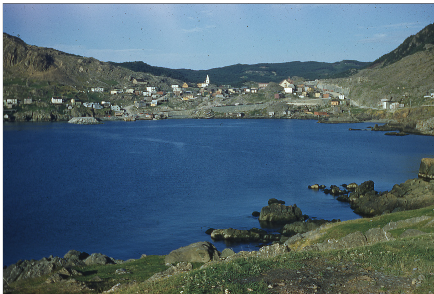
Portugal Cove, 1954.