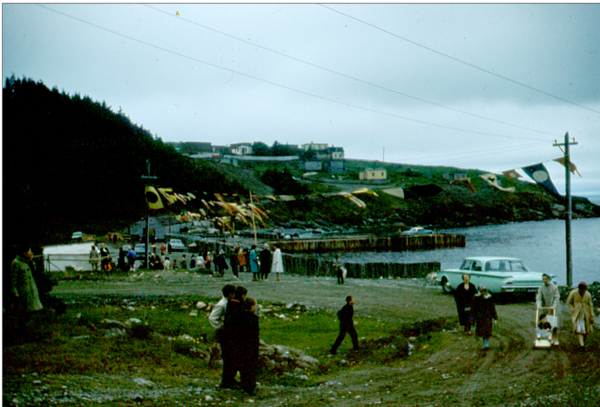
Garden Party July 12th 1962.

“I have no plans on moving anytime soon – my age will probably force me later on, but I like it here. My husband likes it here too... It’s just a nice community, you know? It’s very nice, it’s very quiet. I think if anybody, you know, who didn’t live here and came here to live, I think they would enjoy it. It’s nice. I didn’t know where we would have bought a house when we bought it, we just happened to see it down here. It’s close to everything... it’s a nice place.”