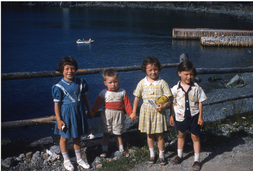
Four unidentified children in front of Broad Cove, St. Philip's. 1962.