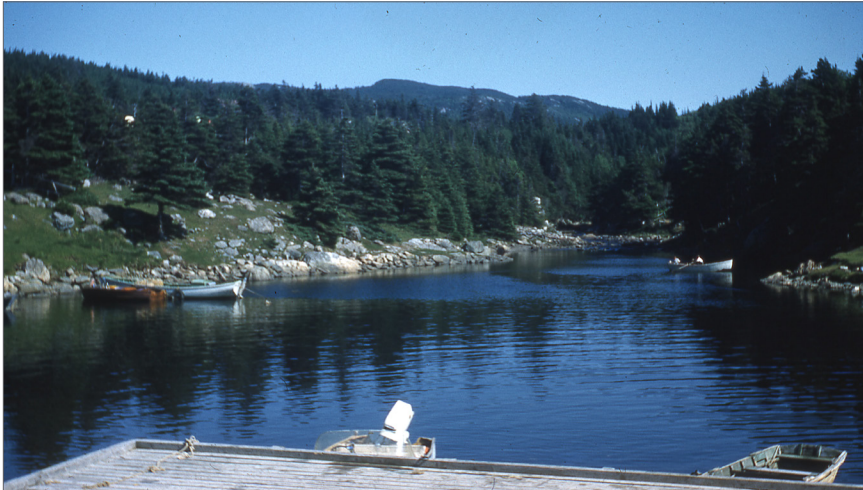
St. Philip's Pond, June 30th 1962.

"I live more in the past than in the future or the present. I always did. When I was going to school, history and geography were my two passions. Especially history. For some reason, I don't know why you get hooked on something [...] I think it was just about how the things were back that then, what they did and so on. [...] I don't know, just an interest I had... why someone becomes a hockey player, what made you become a soccer player. It was just something I was interested in, it was just in me for some reason. Then I just kept at it, and at it, and at it, it just got more and more challenging. Then I got into family history, and it was fine, doing genealogy. Not even one thing in particular, but the overall thing, history, how did this come about."