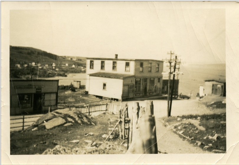
“Taken on the top of Somerton’s land, Portugal Cove looking towards Harding’s Hill and Western Point.” c.1950.