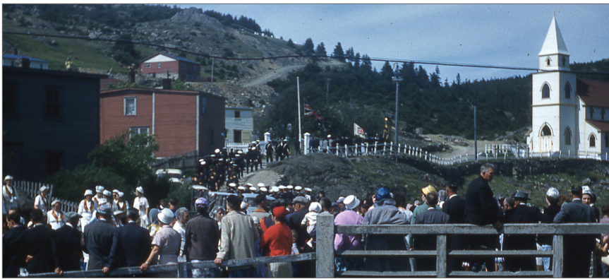
Memorial Day Service by in Portugal Cove, July 1st 1962.