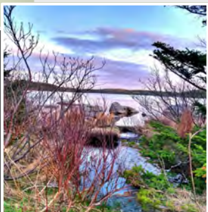
Submitted by: Mal McDonald