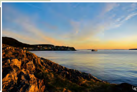
Submitted by: Colin Lane