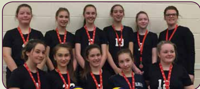
Grade 8 Girls Volleyball team win silver at the Burger King Classic