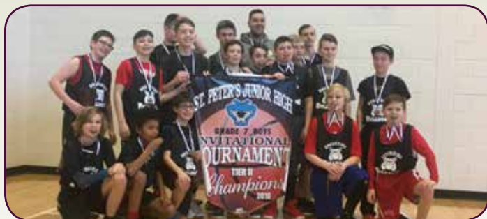
Grade 7 Boys Basketball team crowned champions at St. Peter's Junior High Invitational