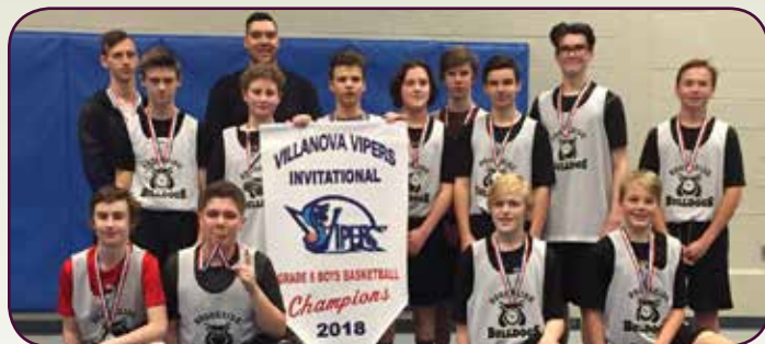
Grade 8 Boys Basketball team win Villanova Vipers Invitational tournament