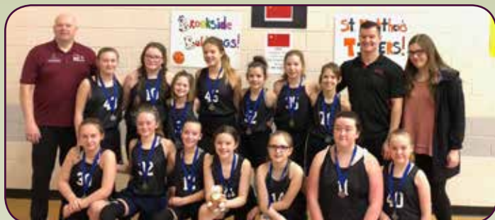
Grade 6 Girls Basketball team wins silver medal at Provincials