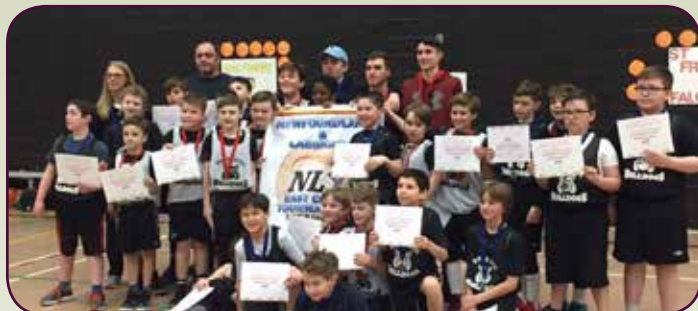
Grade 5 Boys Basketball team wins gold and silver medals at Provincials