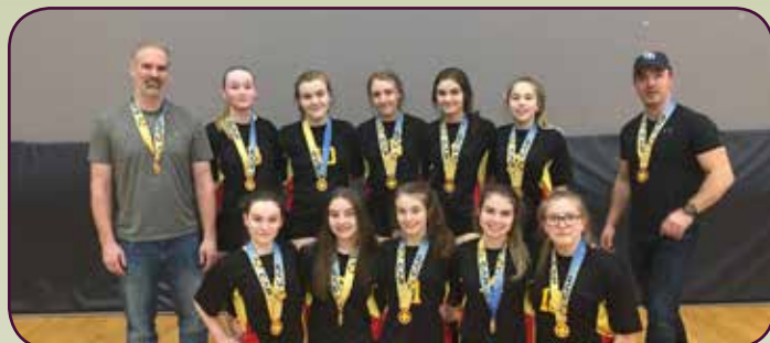
Grade 9 Girls Volleyball team wins bronze at Provincials