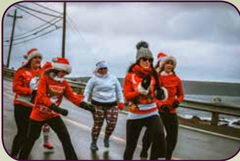
Best Business – Get Your Freak on Fitness

During the holiday season, we had another great Christmas parade! We had lots of amazing floats from community groups, businesses and families from throughout PCSP. We were proud to again recognize the very best and award our Annual PCSP Christmas Parade winners. A huge thank you to all participants and see you next year!