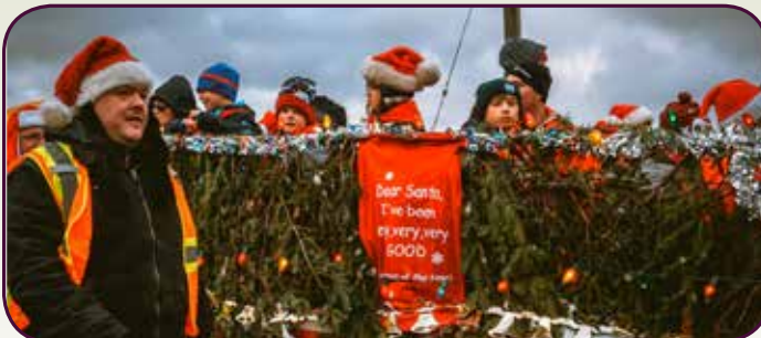
Best Community Group – 1st Portugal Cove Scouts