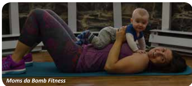
Moms da Bomb Fitness

Cost: $90 for one class a week/$160 for two classes a week Child Minding will be provided