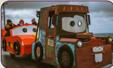
Best Family Float – The Tucker Family