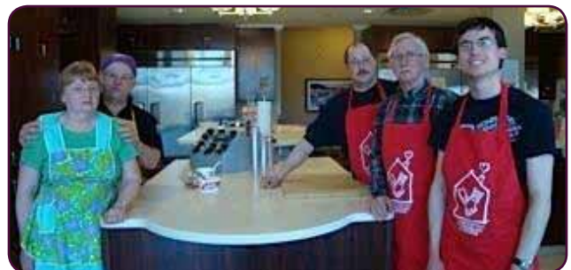
The Lion's at Ronald McDonald House

We are always on the lookout for new Lions to help us serve our community. To find out more about becoming a Lion, you can call 895-6940, Google our Club website, or visit www.be-a-lion.org . Don't forget to follow us on Twitter @PCSPLions.