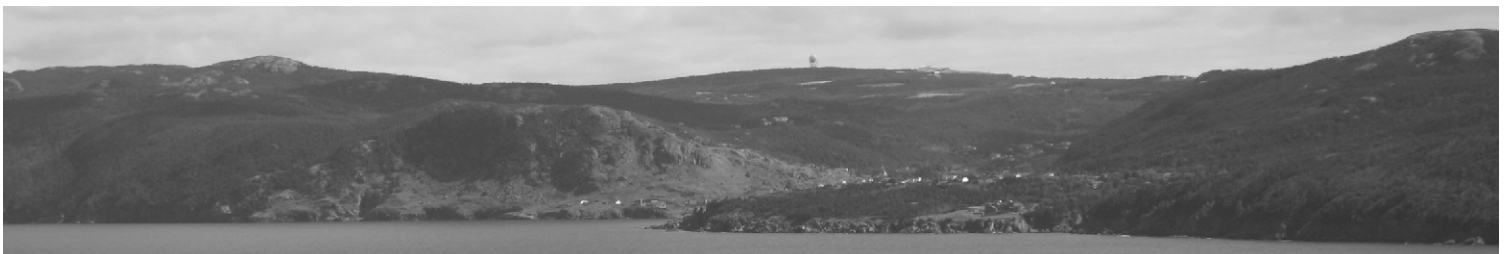
Looking back - Portugal Cove, as taken from the crown of the derrick of the Henry Goodrich drill rig, recently moored in Conception Bay.