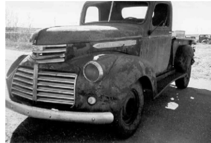
Not as pictured. (The one is older)