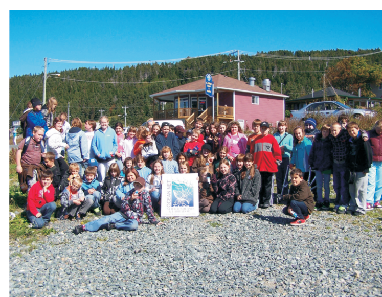
Grade five (5) Children from Beachy Cove Elementary, participating in an Ocean Net Day beach Clean-up of St. Philip's Beach in September

As with most tourist guide maps, this one is not designed to include all the details of a regular map or to be entirely accurate with respect to scale. It shows only the main roads into the community and to some of the tourist locations. Through the use of a variety of icons, amongst them the new town logo, the map highlights