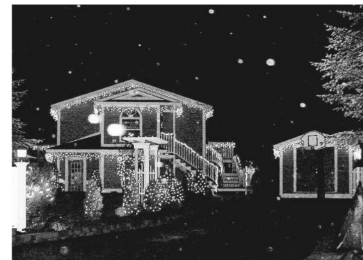
Past winner of the Christmas decorating contest, Parrott Drive