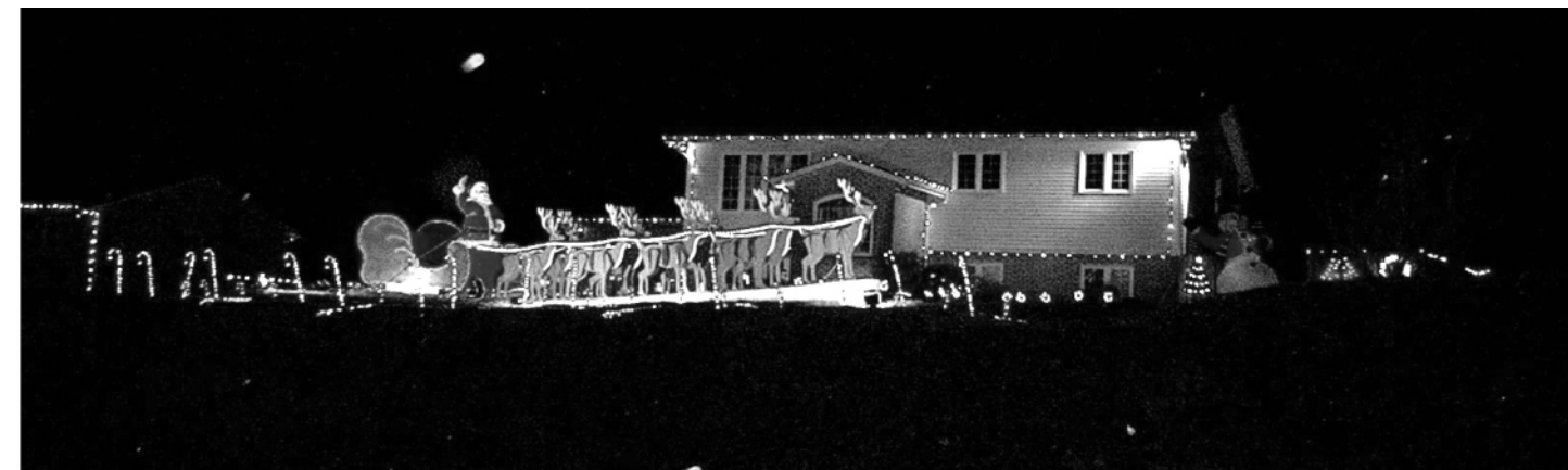
Past winner of Christmas decorating contest, Beachy Cove Road