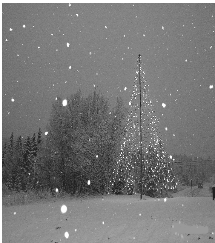
The Town Christmas tree at last year's tree lighting ceremony