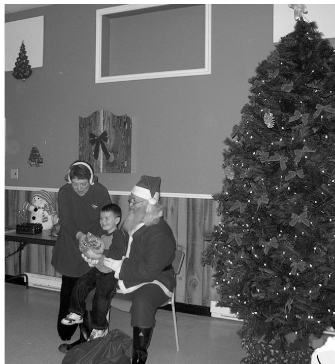
Santa Claus visits with children at story time last year