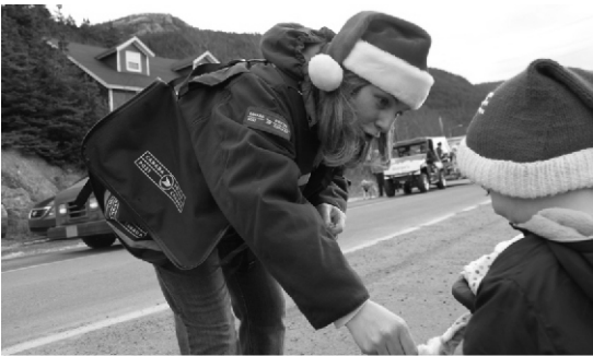
Canada Post employees gather letters to Santa at the recent Santa Claus Parade

The Town provides tags for your dogs, free of charge. When your pet has a tag on, if s/he strays, it is easier for the Town to locate its' owner when dogs are suited with tags. Call the Town office at 895-8000 to arrange for your dogs tag.