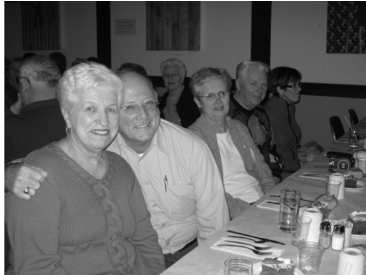
Local residents attended the 2010 Seniors' Party at the Legion on January 9.

If you have any questions, please call 895-8000, Accounts Dept. or press '0' for assistance.