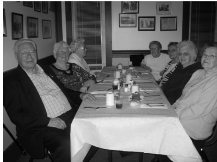
Local residents enjoyed the Seniors' Party put off by the Legion, the Lions Club and the Town of PCSP.