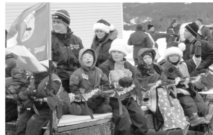
Portugal Cove - St. Philip's Beavers & Cubs atop a float at the recent PCSP Santa Clause Parade in December.