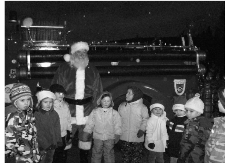
Santa arrives in the old pumper at the town tree lighting ceremony.