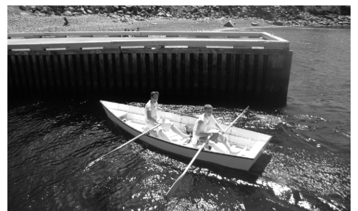
Two young rowers enjoying the PCSP Festival and Regatta